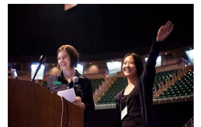
HEALTHCARE & HEALTH INSURANCE PRESENTATION AT ORIENTATION